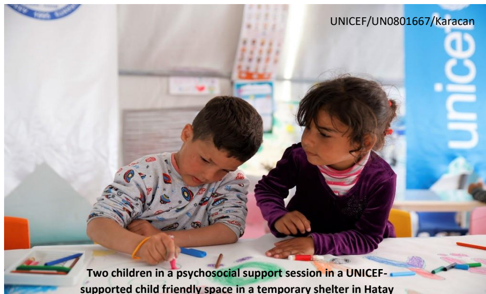
Two children in a psychosocial support session in a UNICEF-supported child friendly space in a temporary shelter in Hatay